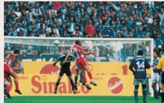
Middle East and South America. Today, Sinalco is once again found in over 50 of the world's countries, most recently in Austria.