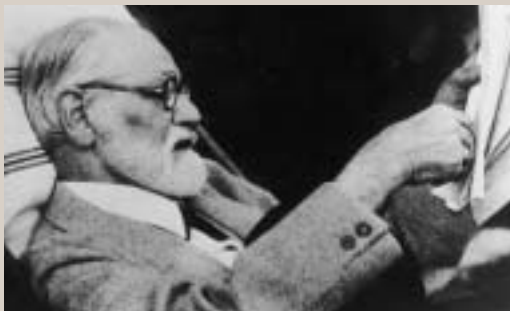
S.Freud 1932

1., Donaukanal/Augartenbrücke 533 75 25, www.flex.at